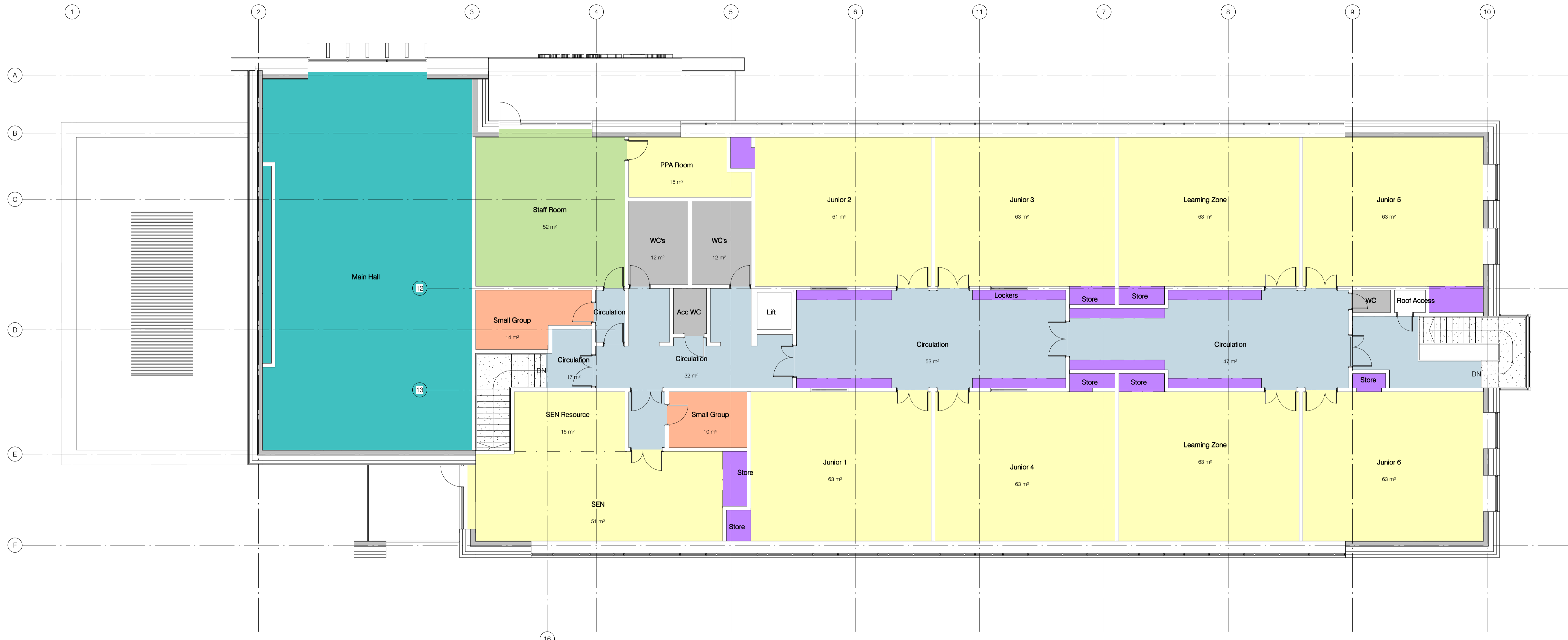
First Floor Plan 1 : 100